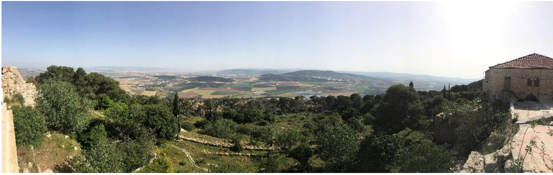
View from The Church of the Transfiguration Mt Tabor, Israel