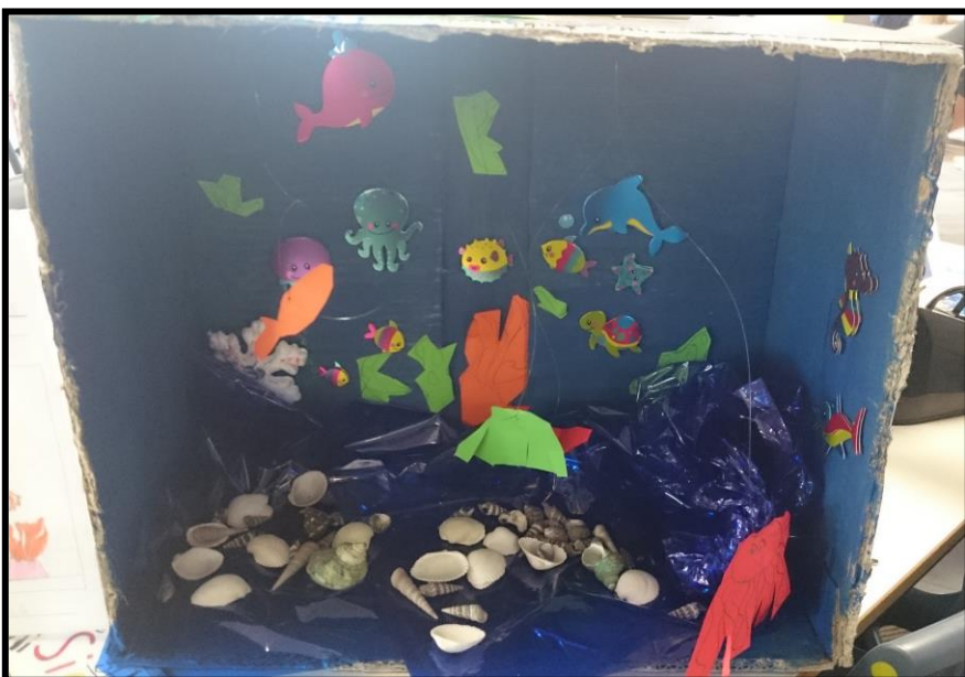
The Great Barrier Reef