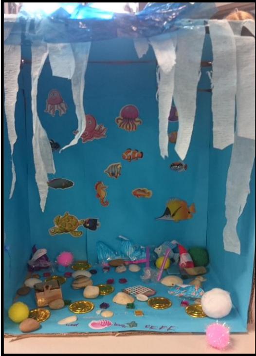
The Great Barrier Reef

This term, as part of our Geography unit, Year 2 has been learning about landmarks in Australia. Students researched a landmark of their choice, made a model of their landmark and created a brochure. Students worked co-operatively to share and gather information. The models created were amazing and students were very creative. Here are some of our models!