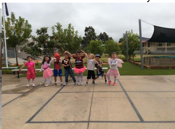
Kindies always surprise us