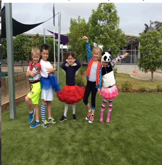
Year 1 Goes Crazy