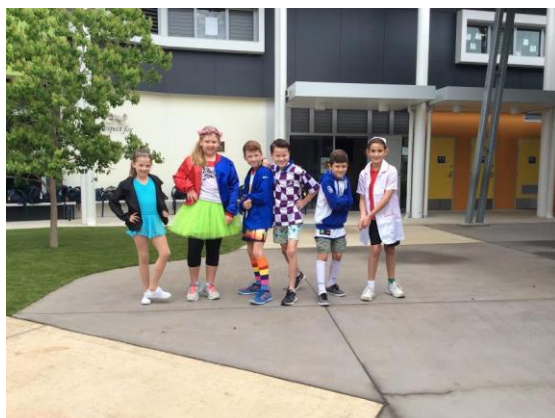
Year 3 strut their moves.