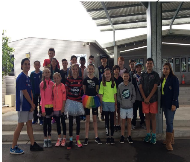
6W Bursts Of Wild Colours