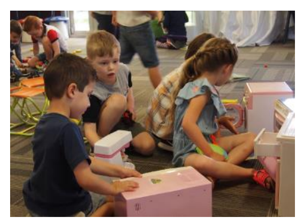
Kindergarten 2017 Orientation