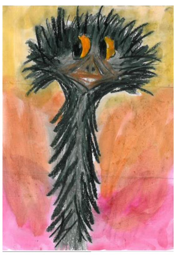
By Ailbhe Gannon

In year 4 this term our artwork is based on Australia. We are learning how to sketch and proportion our pictures. Here are some examples of art portraying a native Australia emu. We hope you enjoy our creative art.