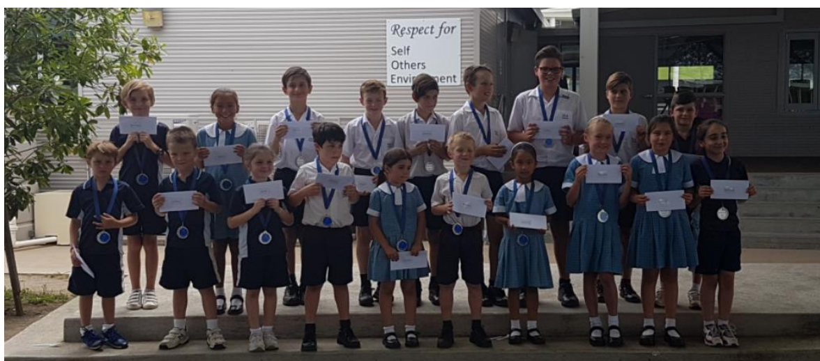
Principal Award Recipients Term 4 2016

Please help them by buying a bracelet or band this Wednesday.