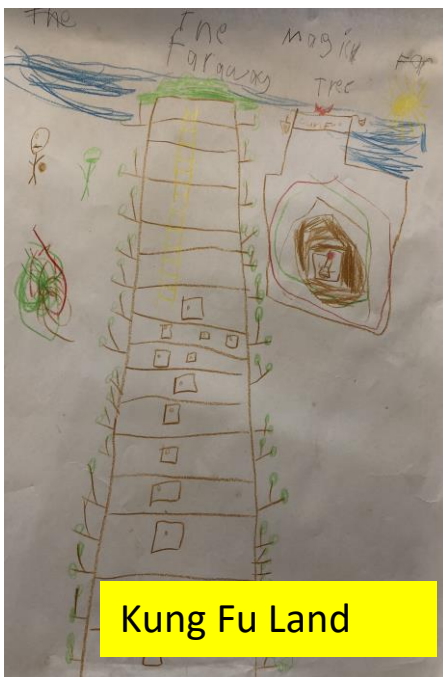
Kung Fu Land

This term children in Year One are reading the novel The Magic Faraway Tree by Enid Blyton. The story takes place in an enchanted forest where a magical tree grows. When the characters reach the top branches they discover many faraway lands. Here are some faraway lands the children in 1B would like to find at the top of the tree!