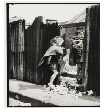
Sydney 1949

Schools submit their best entry from each stage.