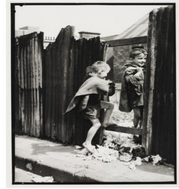
Sydney 1949

Schools submit their best entry from each stage.