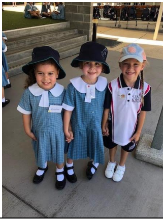
Welcome Kindy OLA & Santa Sophia