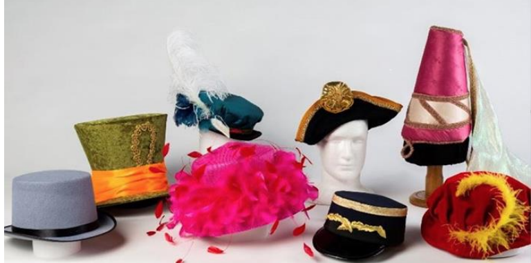
Hats Off 2019