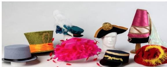
Hats Off 2019

To participate in the competition, students compose an imaginative text of up to 500 words in length using the image above (eight different hats on display stands) as a stimulus.