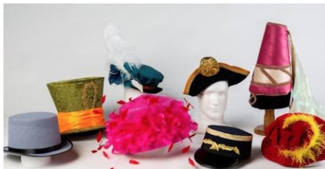
Hats Off 2019

To participate in the competition, students compose an imaginative text of up to 500 words in length using the image above (eight different hats on display stands) as a stimulus.