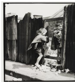
Sydney 1969

Schools submit their best entry from each stage.